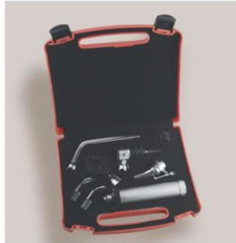
DS-5201-2 Standard Diagnostic Set