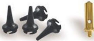
DS-5209-1 Disposable Canulas for Otoscope DS-5209-2 Replacement Lamp for Ophthalmoscope DS-5209-3 Replacement Lamp for Otoscope