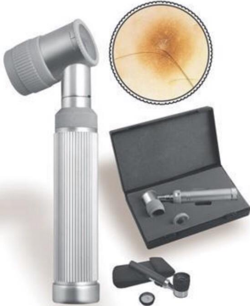
DS-5205-1 Standard Dermatoscope, Brass CP Magnification 5x and 8x Also available in plastic handle