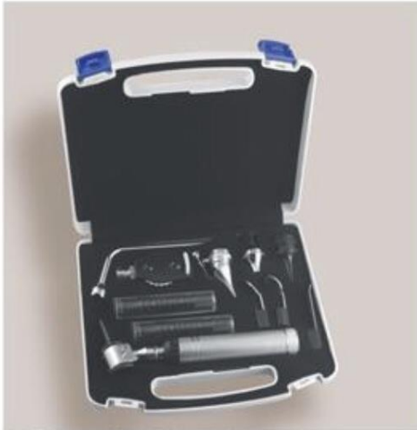
DS-5201-1 Universal Diagnostic Set