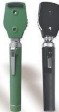
DS-5204-2 Mini Ophthalmoscope, Std Lamp